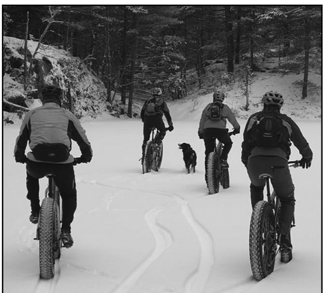
Fat bikers head out on snow covered trails at the Triangle Cross Country Ski Club.

in September when all of the dedicated hard work and effort will be rewarded. Find more info online; www.triangleski.club.org